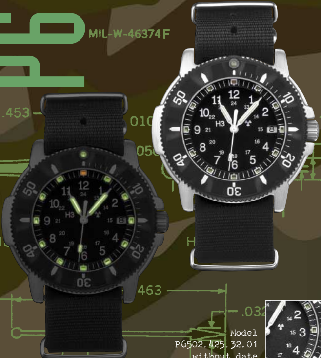
Model P6502.425.32.01 without date