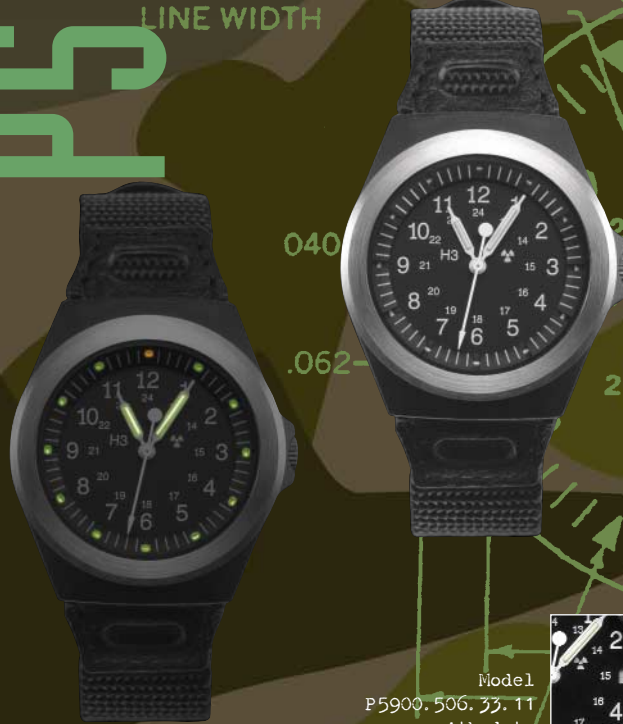
Model P5900.506.33.11 with date