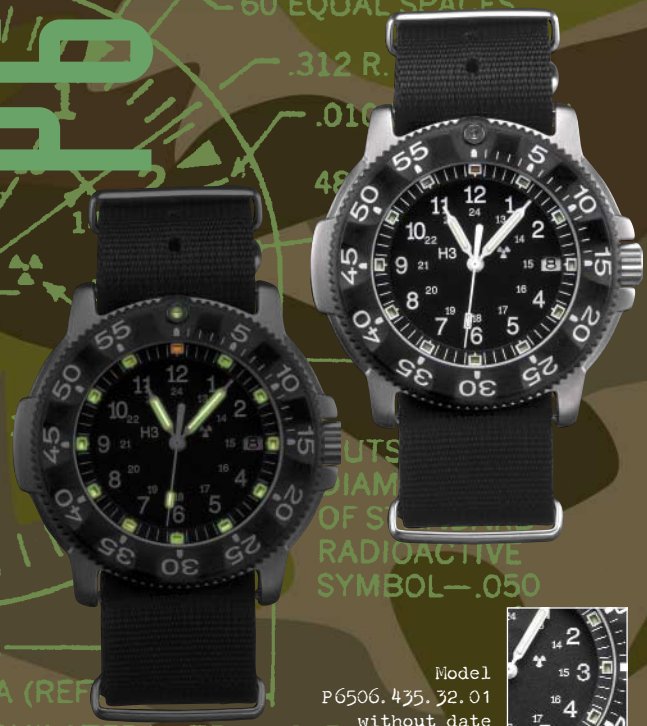
Model P6506.435.32.01 without date

WATCH, WRIST COMMANDER TITAN MIL-W-46374F COMMANDER TITAN MILLICURIES-UNDER 25-3H P6506.430.32.01