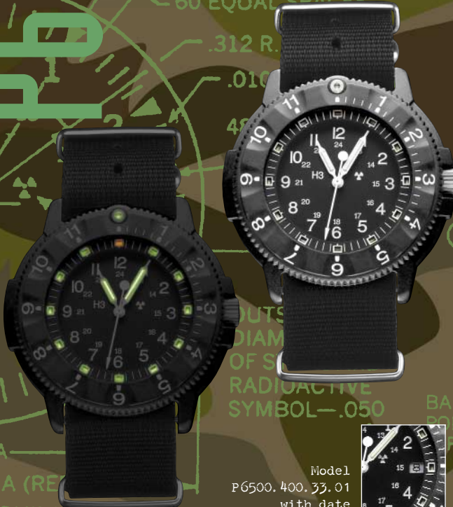
Model P6500.400.33.01 with date